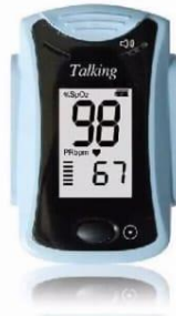
Talking Pulse Oxi Meter